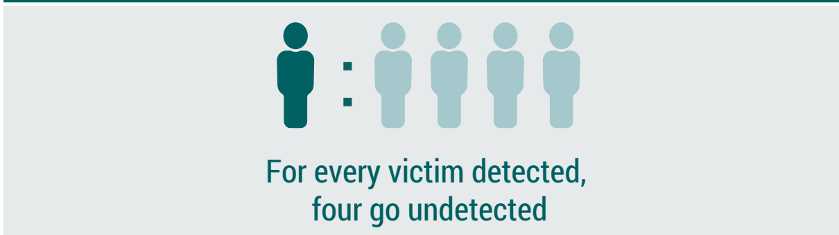
Figure 2: Estimated ratio of detected to undetected victims

The victimisation rate was found to be approximately 3.3 per 100,000 population per year. This was calculated using the total Australian population, although it should be noted that the majority of observed victims are adults.